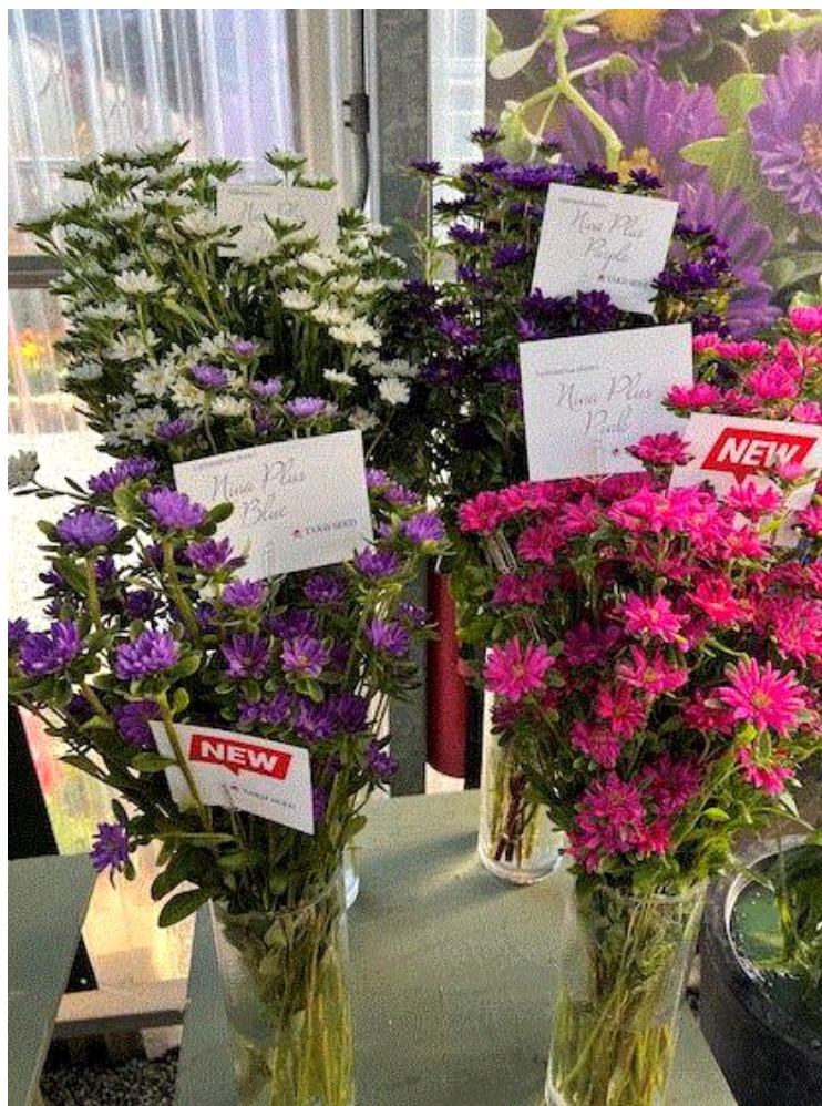
Nina Plus Asters

In calistephus (aster), the Nina Plus series is a spray aster series with small but plentiful flowers, strong stems and good resistance to fusarium. Tater and I prefer asters with more petal fill and softer colors, but the disease resistance is a major benefit. Four colors: Blue, Pink, Purple and White.