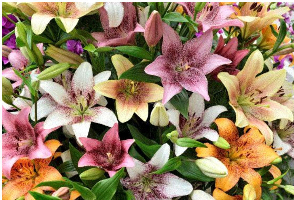
Asiatic lilies from Zabo Plant

Our Friends at Zabo Plant sent Tater and I a sneak peek of some impressive lilies from the upcoming Dutch Lily Days event this year, scheduled for June 4 - 7. Every year, lily breeders and exporters in the Netherlands open their doors to growers, distributors and horticulturalists from all over the world to showcase the newest lily varieties and upcoming innovations in lily production (both cut and potted). Some trends include pollen-free varieties, disease resistance and even unscented lilies.