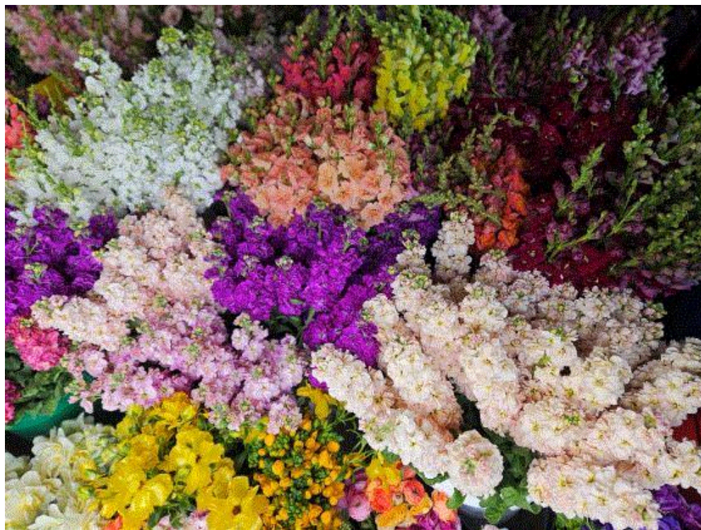
One of our incredible van loads of flowers last week.

We are rounding the final turn of the Mother's Day marathon. To be honest, I am sweating bullets. What makes me laugh is that last Mother's Day was about the same date as this year's.