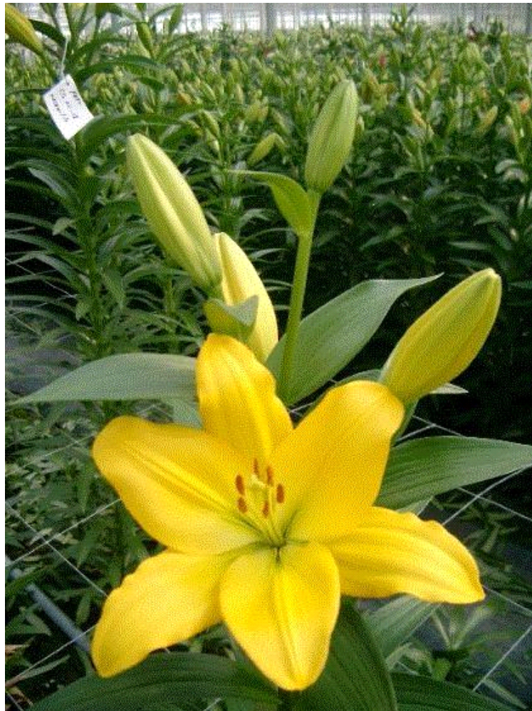
'Nashville' Asiatic lily.

'Nashville' is an outstanding yellow Asiatic lily, a tried and true variety. I cut hundreds of bunches of these beauties at the previous farm I worked at. According to our friends at Zabo Plant, this is still one of the best yellow Asiatics in the business.