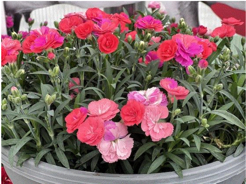
Constant Cadence Potpourri Dianthus