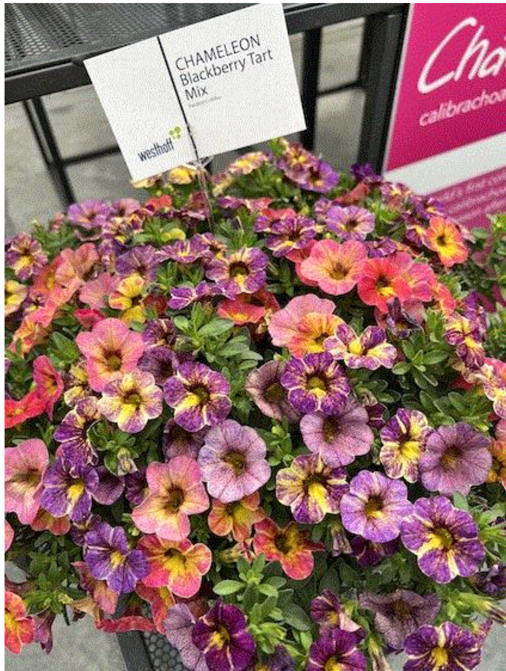
Calibrachoa Chameleon Blackberry Tart Mix