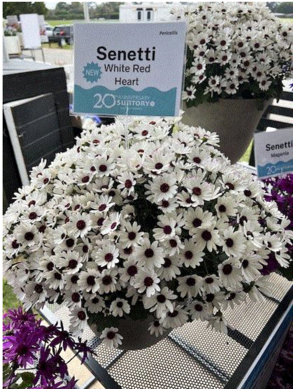
Senetti White Red Heart Pericallis

Bill: The Senettis are nice, but I'm glad you didn't take my favorite, the Surfinias. This year, they introduced a new series called Heavenly. It's a semi-trailing type with uniform vigor, habit and timing across four colors—Amethyst Burst, Cabernet, Blue and Deep Red. They also have a couple new additions to the vigorous XXL Surfinia series—Salmon Vein and Watermelon Jazz.