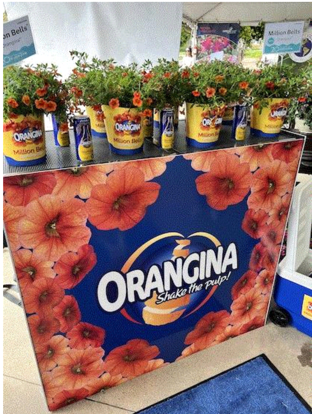
Calibrachoa Million Bells Orangina