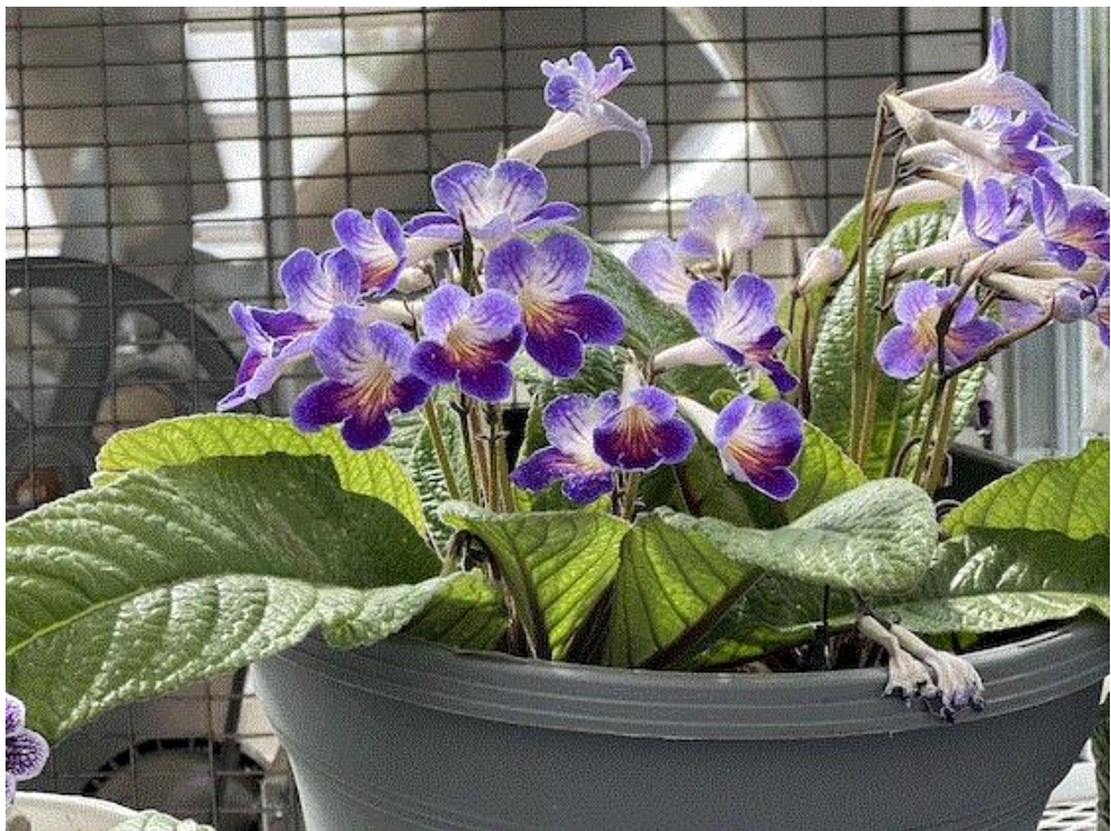
Streptocarpus Ladyslipper Azure