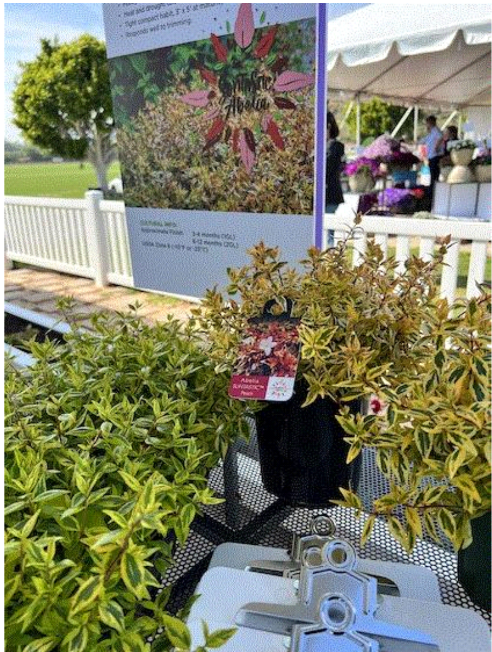
Abelia Suntastic Peach